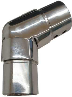
A30381 Connector for cap rail - Adjustable flush angle, 135° upwards