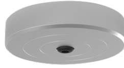
Cable base - Surface-mounted A80051