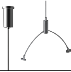
Suspension wire with base - 4 m - Y type A80061-Y