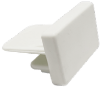
End cap IRC-0232