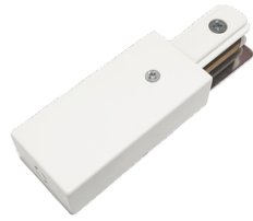
Live end connector IRC-0231