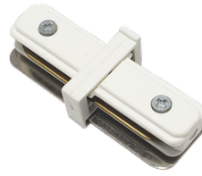
Straight connector IRC-0234