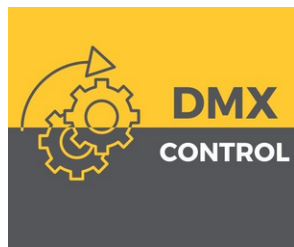
DMX Control System Control-DMX