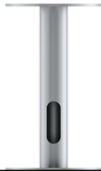
Root mount kit A20791