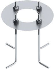
Anchor bolt A10491