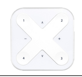
Xpress wireless switch A90591