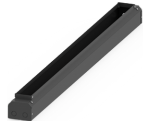
Recessing box A61051