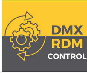
DMX/RDM Control System Control-DMX-RDM