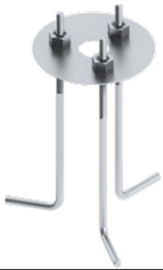
Anchor bolt A10791