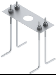
Anchor bolt A11191