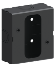
Surface mounting box for easy cabling (GINO 1) SCE-GINO-1