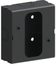
Surface mounting box for easy cabling (GINO 2) SCE-GINO-2