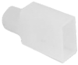
Connector silicone - Power feed connector A80112