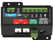
Constant voltage dimmer - 4 Channel A610291