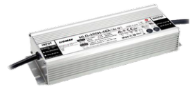
Driver (CV) - PWM - 320 W - IP65 - 24 V A33491-PW