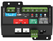
Constant voltage dimmer - 4 Channel A610291