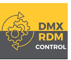
DMX/RDM Control System Control-DMX-RDM