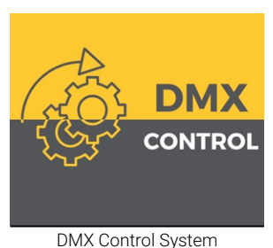
MX Control System Control-DMX