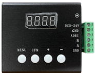
DMX address writer for LISSE A612691