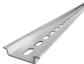
Mounting rail for LISSE A613091