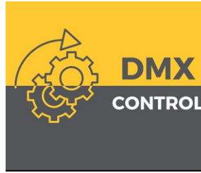
DMX Control System Control-DMX