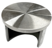
End cap for cap rail A30581