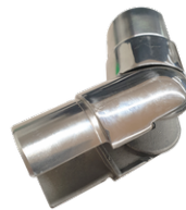
Connector for cap rail - Adjustable flush angle, 135° downwards A30481