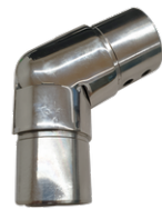
Connector for cap rail - Adjustable flush angle, 135° upwards A30381