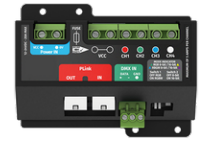
Constant voltage dimmer - 4 Channel A610291