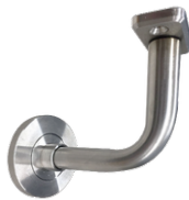
Wall bracket A30681