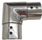
Connector for cap rail - Flush elbow 90° A30281