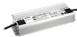
Driver (CV) - PWM - 320 W - IP65 - 24 V A33491-PW