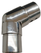
Connector for cap rail - Adjustable flush angle, 135° upwards A30381