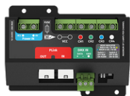
Constant voltage dimmer - 4 Channel A610291