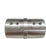
Connector for cap rail - Straight A30181