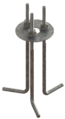
Anchor bolt A14391