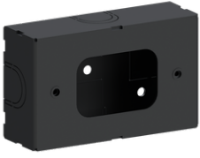
Surface mounting box for easy cabling (MATRIX 11) SCE-MATRIX-11