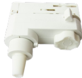
3 phase pendant adapter (White) A80007