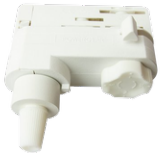
3 phase pendant adapter (Black) A80008