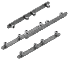
Continuous-coupler bracket (60/70 mm Down & 60 mm Down & Up profile)