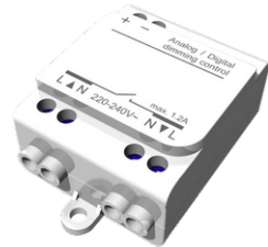
Wireless bluetooth converter A90291