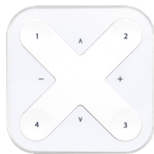
Xpress wireless switch A90591