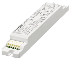
Emergency module - 250V - PRO-DALI EM250V-DA