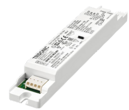
Emergency module - 250V - BASIC EM250V-BA