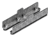
Continuous-coupler bracket (40/50 mm Down profile) A81881