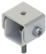
Ceiling-mounting bracket A81281