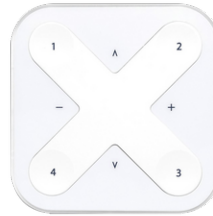
Xpress wireless switch A90591