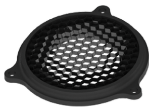
Honeycomb louvre A80121