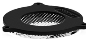
Linear spread lens A80214

Please contact the factory for technical details if you wish to use Anti-glare accessories, Colour filters, Lenses and slip glasses in combination.