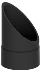
Anti-glare visor A80331