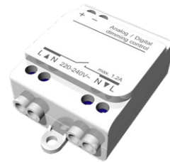
Wireless bluetooth converter A90291