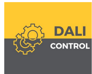
DALI Control System Control-DALI