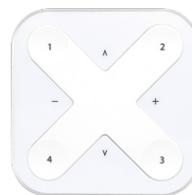
Xpress wireless switch A90591