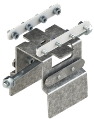
Continuous-coupler bracket A81781