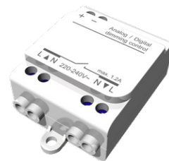
Wireless bluetooth converter A90291