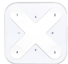
Xpress wireless switch A90591