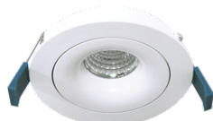
Trim - Shallow directional (White) A80001-M7W