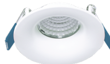
Trim - Curve recessed (White) A80001-M8W