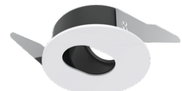
Trim - Key hole IP44 (White) A80001-D5W