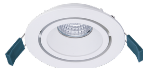
Trim - Deep recessed directional (White) A80001-M5W