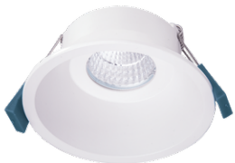
Trim - Deep recessed (White) A80001-M3W