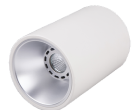
Trim - Surface cylinder (White) A80001-C135W