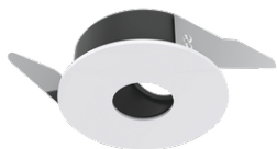
Trim - Pin hole IP44 (White) A80001-D4W