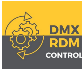
DMX/RDM Control System Control-DMX-RDM

Please contact the factory for technical details if you wish to use Anti-glare accessories, Colour filters, Lenses and slip glasses in combination.