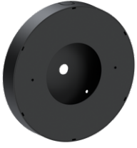
Surface mounting box for easy cabling (SANDY 3) SCE-SANDY-3