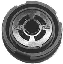
Zhaga Book 18 socket (Up) A90991-U