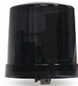
NEMA 7 socket A90891