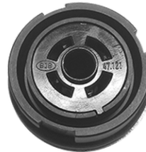
Zhaga Book 18 socket (Up) A90991-U