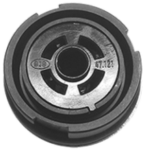
Zhaga Book 18 socket (Up) A90991-U