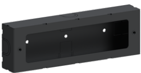
Surface mounting box for easy cabling (VEKTER 1) SCE-VEKTER-1