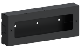
Surface mounting box for easy cabling (VEKTER 2) SCE-VEKTER-2